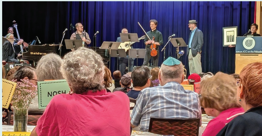
Yiddish Concert at JCC on the Palisades