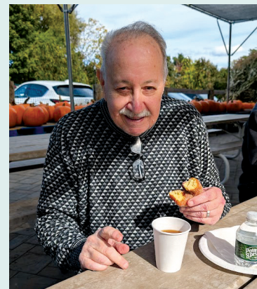
Delicious donut tasting at Demarest Farms