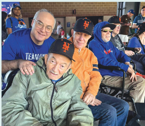
Citi Field game day