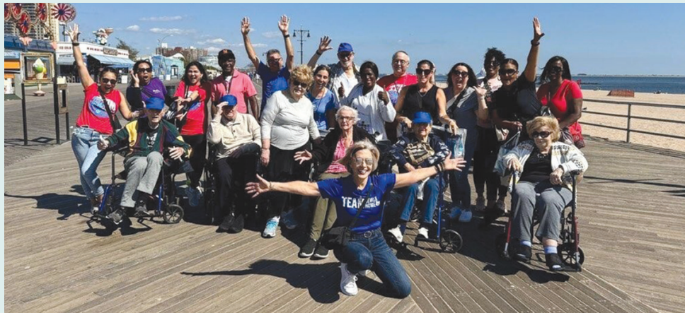
Sun and fun at Coney Island

Jewish Home Family elders do not sit still. They are out and about in the community. Whether cheering for the NY Mets at Citi Field or enjoying the boardwalk in Coney Island, nothing stops our elders from living their best life!