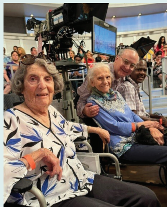
NBC Studios: "The View"