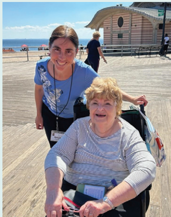
Coney Island smiles